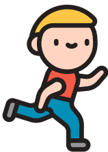
Climbing, balancing, running and jumping