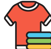
A change of clothes including socks and underwear

Check with your school or community kindergarten as to what else your child might need.