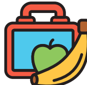
A lunchbox with lunch and some snacks