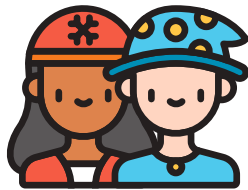
Dressing up and imaginative play