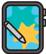
Using digital technologies