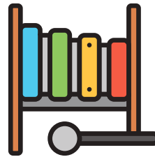
Singing, listening to and playing music