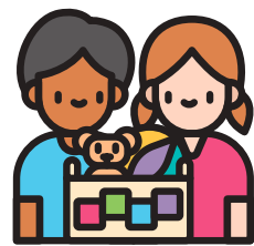
Opportunities to share with other children and develop independence