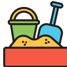
Playing with clay, play dough, sand and water