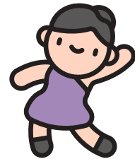
Dancing and drama