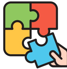
Puzzles and construction play