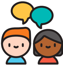
Talking and listening