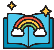
Exploring books, listening to stories and storytelling