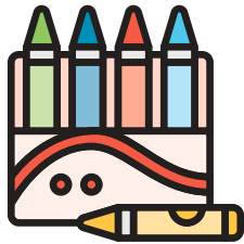
Painting, drawing, cutting and pasting

Your child will experience many different learning activities.